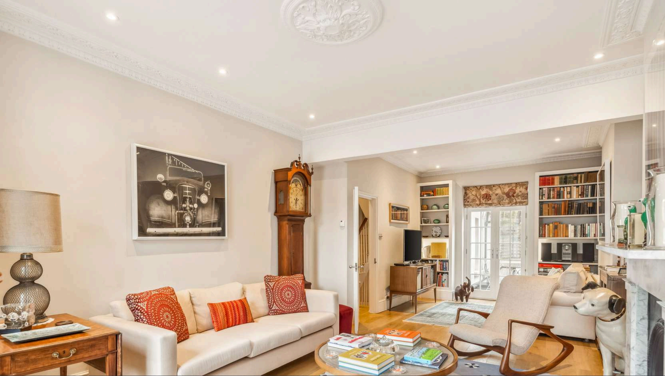
Penzance Place | Notting Hill, W11 OIEO £3,500,000