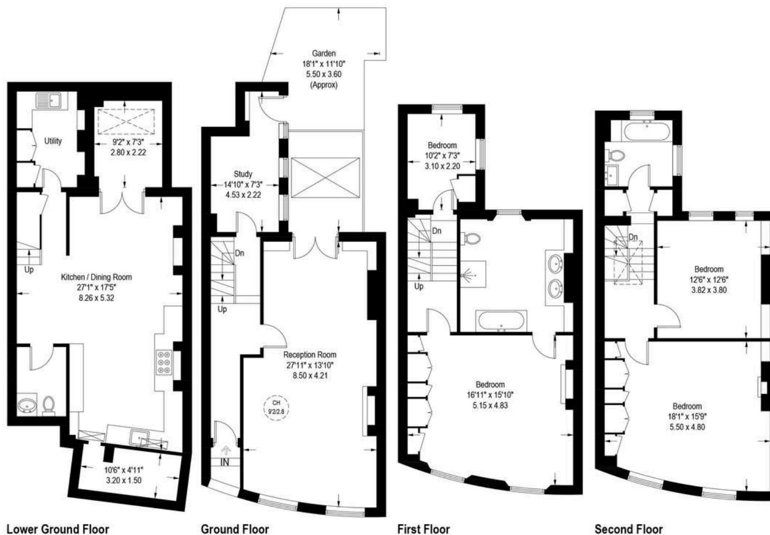
Illustration for identification purposes only, measurements are approximate, not to scale. (ID1158270)